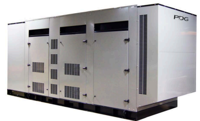
“LEVEL 2” HOUSED GEN-SET

EPA 40CFR Part 60, 1048, 1054, 1065, 1068