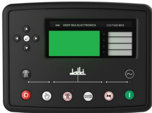
Deep Sea 7420MKII

The “7420MKII” controller is an auto start mains (utility) failure module for single gen-set applications. This controller includes a backlit LCD display which always displays the status of the engine and generator.